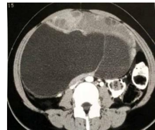
USG and CT showing Mucinous Cystadenocarcinoma