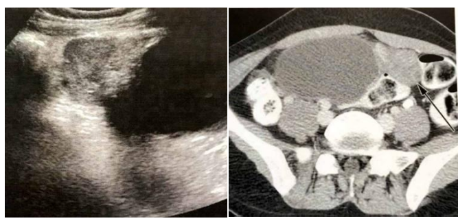
USG and CT showing Twisted Ovarian cyst