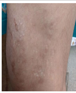
Figure 1-4 showing lesions of LSA overlying the lesions of morphea