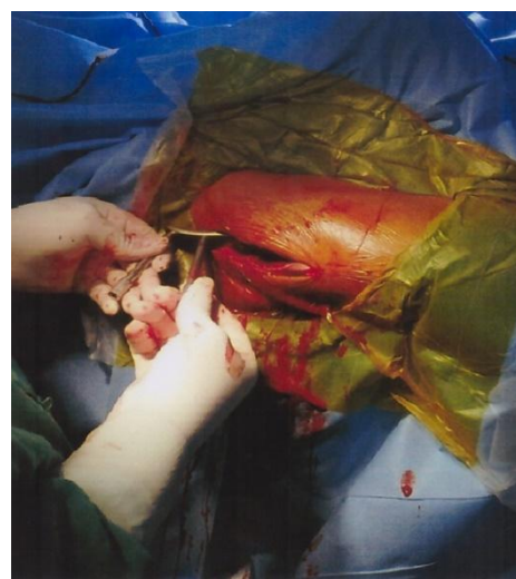
Placement of Guide Wires Into Neck Femur