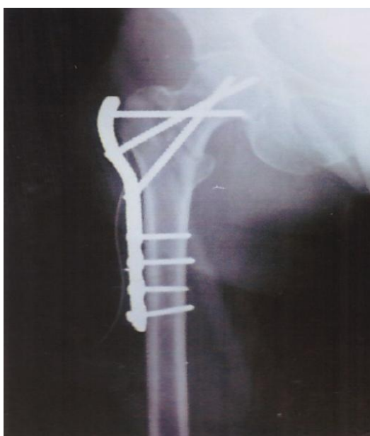
First Post-Operative Day X-Ray