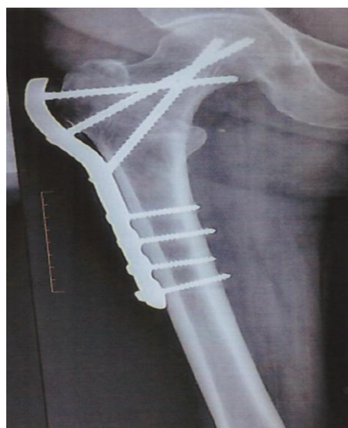
After 6 Months