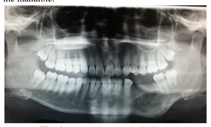
Fig. 4 - 6 months post op OPG

Microscopic examination with H & E staining showed fibrocellular connective tissue stroma interspersed with plump and spindle shaped fibroblasts. Few fibroblasts with angular and hyperchromatic nuclei with minimal mitotic activity. Multinucleated giant cell was present. Trabeculae of immature bone with osteocytes in lacunae were present. Cementum like calcification with dystrophic calcification were also present. Blood vessels lined by endothelial cells along with areas of haemorrhage were also seen. All these histologic features led to a final diagnosis of trabecular form of juvenile ossifying fibroma of the mandible.