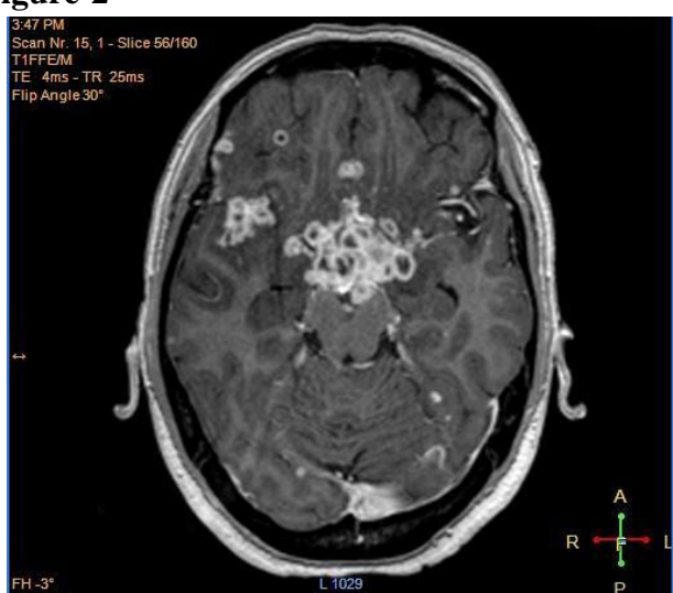
MRI BRAIN axial view Post-gadolinium enhanced T1W image in axial section showing multiple ring enhancing lesions clustered around optic chiasma and intracranially in frontoparietal region