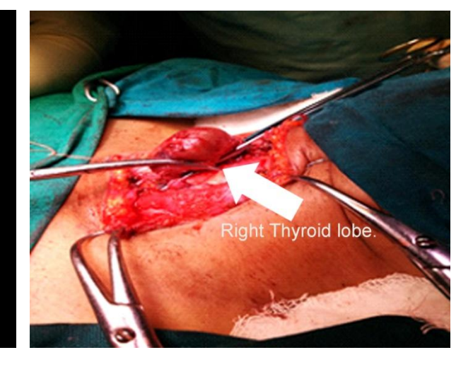
Fig, 4: Intra operative photograph of thyroid swelling

Irrespective of the location the surgical treatment remains the same i.e. complete excision of epidermoid cyst along with the capsule. There is a 3% recurrence rate noted and reported, hence excision of the entire cyst wall is recommended<sup>5</sup>. For swellings over the other areas or those which are limited to skin and subcutaneous tissue, diagnosis of epidermoid cyst becomes quite easy.