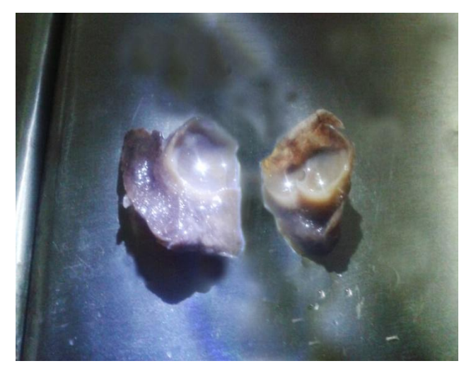
Fig. 5: Cut-section of the specimen showing presence of cyst.