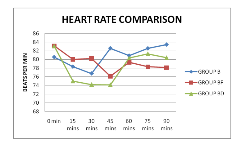
Fig 2. Heart Rate Trend In Three Groups

A sedation Score of 3 was most often noted in patients of Group BD (17 patients) compared to Group BF and B, a statistically significant observation. Bradycardia was observed in 2 patients in Group BD and Hypotension in 1 patient of Group BF. Itching was seen in 2 patients receiving Fentanyl as adjuvant.