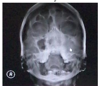
Fig-2: X-ray PNS showing opacification in the region of the left maxillary antrum, bilateral ethmoidal air cells and left nasal cavity with erosion of lateral wall of left maxillary antrum.

X-ray PNS (fig.2) showed opacification in the region of the left maxillary antrum, left ethmoidal air cells and left nasal cavity with erosion of lateral wall of left maxillary antrum.